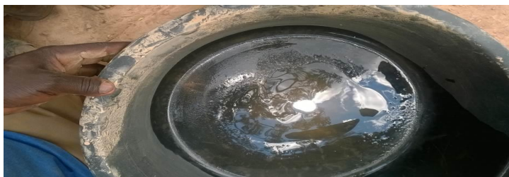
Plate1: Mercury on the Basin to be applied in the gold extraction

Majority; 347/384 (90.4%) of the respondents reported that they used Mercury in the gold extraction process. Of these, 88% reported health problems associate with the use of Mercury. 98% respondents expressed fears regarding the health and ecological implications of mercury use in gold extraction particularly the possibility of food and water pollution. Indeed observation revealed use of large amounts of mercury in the gold extractions. Besides, the mining sites were close to the water sources which accounted for 99% of water requirements for domestic use putting the health of the miners and the surrounding communities at a great health risk.